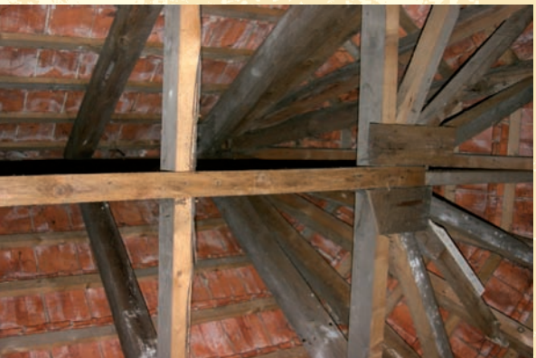
View of the chapel roof truss.