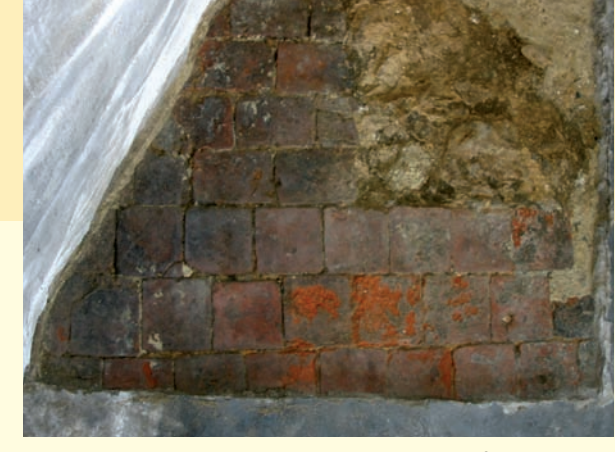
A probe in the chapel interior revealed the original brick flooring and the stone foundation of the altar mensa.