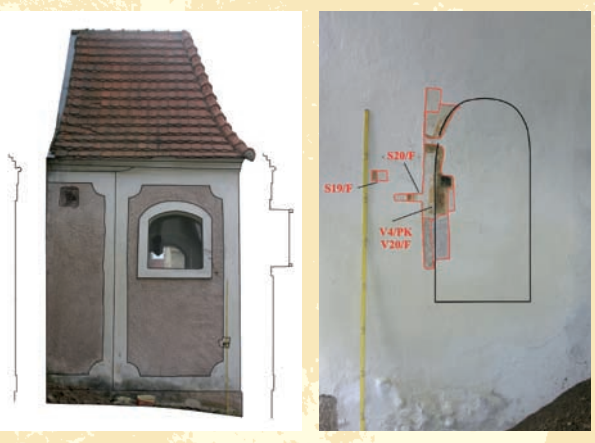
Pictured to the left: record of the state of one of the exterior façades before reconstruction. On the right: tests in the chapel interior uncovered defunct semi-circular niches in the walls.